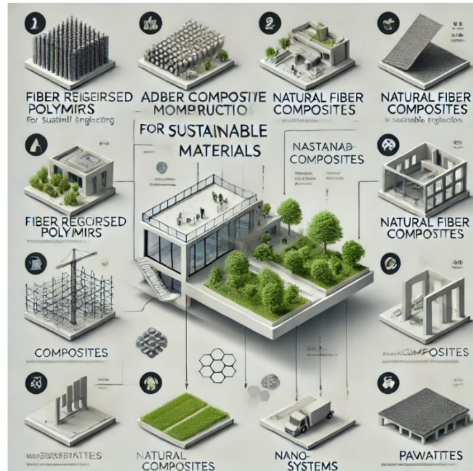
Fig. 1. Overview of Advanced Composite Materials for Sustainable Construction

Figure 2 breaks down the specific advantages of ACMs in sustainable construction into six core benefits: Lightweight, High Strength-to-Weight Ratio, Durability, Corrosion Resistance, Thermal and Acoustic Insulation, and Recyclability. By categorizing these advantages, the infographic provides a clear summary of why ACMs are particularly well-suited for sustainable applications in civil engineering. The lightweight nature of ACMs keeps them efficient, giving them structural properties similar to traditional materials such as steel while weighing only a fraction of the industry standard. Less weight means lower costs when transporting the resource and lower loads on the structure, resulting in significant resource savings in material and energy [12]. The high strength-to-weight ratio of ACMs enhances their utility in civil engineering, as they provide substantial load-bearing capacity while requiring significantly less material. Another essential advantage is durability, ACMs are resilient to wear and resist degradation over time. It also means longer lifespan, less repairs and replacements & lower maintenance cost as well as lower environmental cost in rebuilding again.