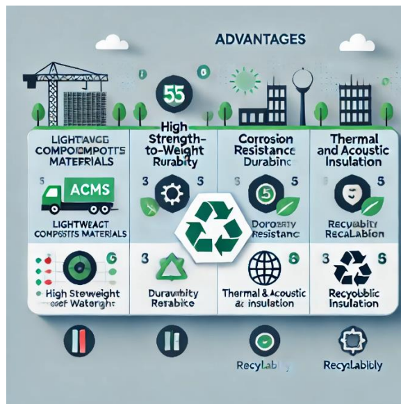
Fig. 2. Advantages of Using Advanced Composite Materials

Figure 2 breaks down the specific advantages of ACMs in sustainable construction into six core benefits: Lightweight, High Strength-to-Weight Ratio, Durability, Corrosion Resistance, Thermal and Acoustic Insulation, and Recyclability. By categorizing these advantages, the infographic provides a clear summary of why ACMs are particularly well-suited for sustainable applications in civil engineering. The lightweight nature of ACMs keeps them efficient, giving them structural properties similar to traditional materials such as steel while weighing only a fraction of the industry standard. Less weight means lower costs when transporting the resource and lower loads on the structure, resulting in significant resource savings in material and energy [12]. The high strength-to-weight ratio of ACMs enhances their utility in civil engineering, as they provide substantial load-bearing capacity while requiring significantly less material. Another essential advantage is durability, ACMs are resilient to wear and resist degradation over time. It also means longer lifespan, less repairs and replacements & lower maintenance cost as well as lower environmental cost in rebuilding again.